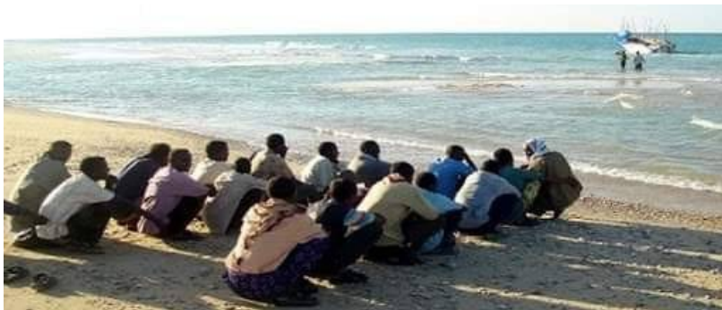
Travellers waiting to board a boat towards Canary Islands.

Alarm Phone - Western Mediterranean Regional Analysis , 1 June - 30 September 2020 Our report covers another turbulent four months of crossings, political developments and daily struggles against the European border