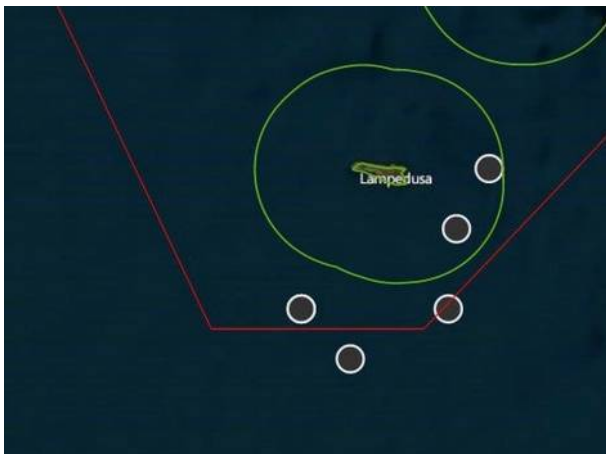
Karte des WTM Alarm Phone vom 3.11.2020 - die rote Linie kennzeichnet die Search and Rescue Zonen von Malta (südlich) und Italien (nördlich)

The WatchTheMed Alarm Phone turned six years old in October - six years of being available around the clock and at the side of the people at