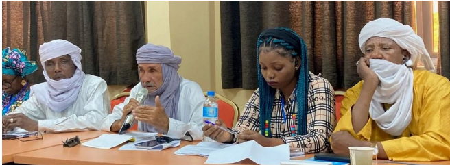
Die Lanceurs d'alerte berichten über untragbare Zustände, denen Migrant*innen im Niger ausgesetzt sind.

When jihadist forces for a short time occupied northern Mali in 2012 and triggered an escalation of violence that continues to this day, the neighbouring country of Niger finally became the main transit country for migrants and refugees from Central and West African countries