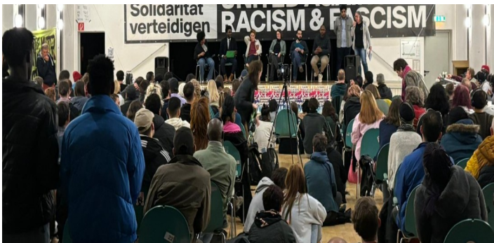
Frankfurt: Konferenz von We'll Come United

preparatory group also formulated in a first summary: „... In two plenary sessions, current struggles against the EU border regime were presented and discussed and the background to flight and migration was thematised. The great multiplicity of anti-racist initiatives and everyday projects that came together in Frankfurt was reflected in 28 workshops prepared by various decentralised groups. At the end of the conference, there was broad agreement that these three days had been a productive exchange in a respectful atmosphere...”