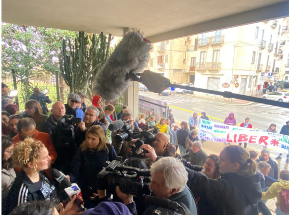
Trapani: Einstellung des Verfahrens gegen Juventa

In addition to practices of resistance against deportations and the infrastructures for freedom of movement at the external borders, another focus of the programme was the discussion about the mass demonstrations against the extreme right. Is it and will it remain a bourgeois fear movement against the AfD that does not want to know anything about the policies of exclusion that are actually taking place? Or are there approaches and ideas on how this movement could develop in the direction of an anti-racist migration society? Does it make sense to get involved and intervene? In Frankfurt, the relatively young anti-fascist