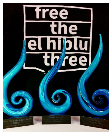
Valetta: Menschenrechtspreis für El HIBLU 3

Im In spring 2014, a good ten years ago, the last major 'No Border is forever' gathering took place at the Studierendenhaus in Frankfurt/Main. At the end of April 2024, around 350 activists from many cities took part in the We'll Come United conference at the same location. A strong momentum, as the