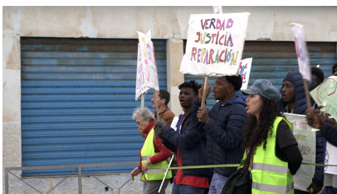
Demonstration in Ceuta on 6 February 2024.

1 October - 31 March 2024 - Children on the Move