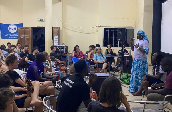
10 Jahre Alarm Phone Treffen in Dakar im Oktober 2024

death at sea has become our companion. Many times, facing such cruelty by the murderous border regime, we feel helpless anger. At the same time, we realise again and again how we can often accompany boats and empower autonomous landings in Europe. (...) We have built a transnational and multilingual collective that is committed to stay at the side of people who enact their right to move..(...) Due to our relationships